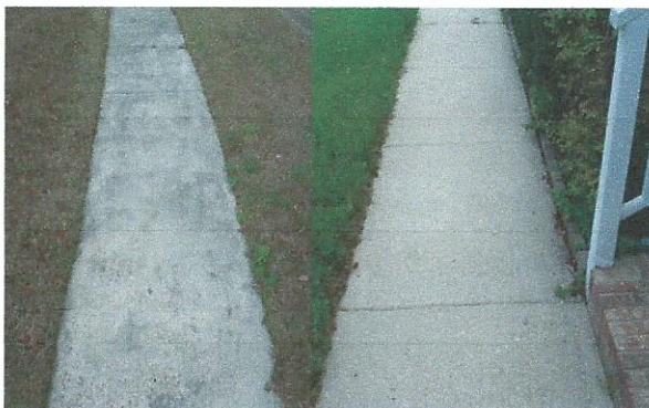
After Three Years